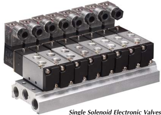
Single Solenoid Electronic Valves Mounted on 8-Station Manifold

Note: This numbering schematic is shown for illustration purposes only. All possible configurations are not available. For standard models, see the products illustrated in this catalog.